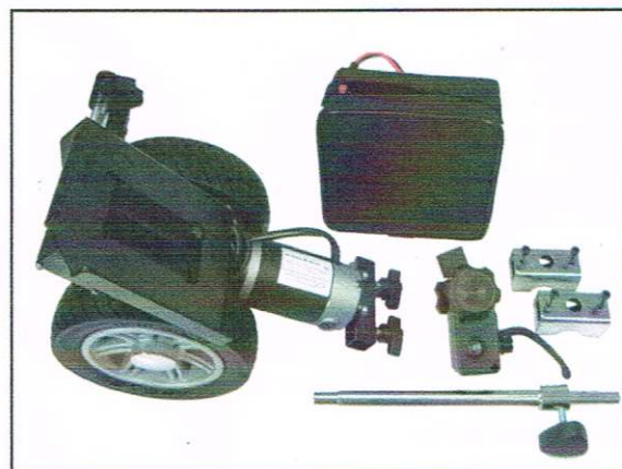
The Power Assist Unit