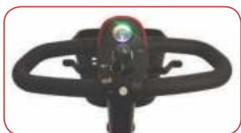
Easy Drive Tiller

The Go-Go ® Sport delivers high-performance and convenience on the go. With a 147 kg (325 lb.) weight capacity, a charger port in the tiller, standard front LED lighting and a maximum speed up to 7.56 km/h (4.7 mph), the Go-Go ® Sport is feature rich and travel ready.